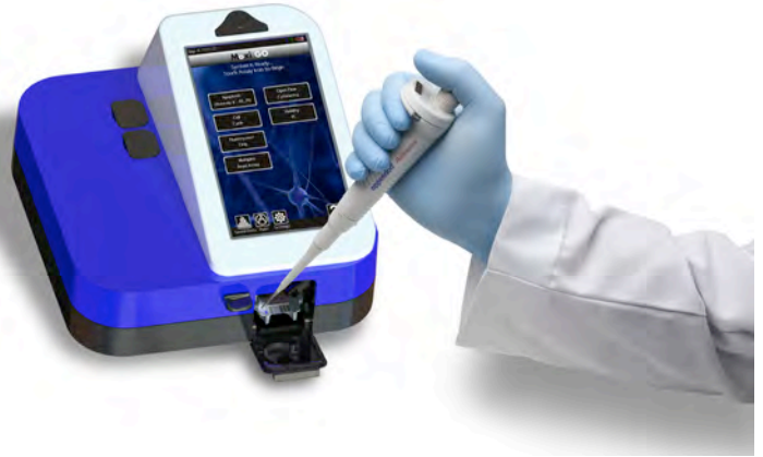
Figure 1 – Orflo's Moxi GO II – Next Generation Flow Cytometer. Image shows user loading a sample into the two-test disposable flow cell. The Moxi GO II is a configurable flow cytometer with a 488nm laser and up to two fluorescence recording channels (2 PMT's with emission filters at 525/45nm filter and 561nm/LP, respectively).

Numerous transfection/transduction approaches have been developed for introducing the cloning vectors into the cells, ranging from viral (i.e. viral transduction) to chemical (e.g. lipofection), and physical (e.g. electroporation). 1 These techniques are coupled with the use of DNA restriction endonucleases or, alternatively, the Clustered Regularly Interspaced Short Palindromic Repeats (CRISPR)/Cas-9 subsystem (an RNA restriction enzyme approach) to ensure the proper insertion of the sequence into the host genome. The CRISPR approach, in particular, has received tremendous momentum over the past couple of years due to its low cost, versatility and simplicity. 2