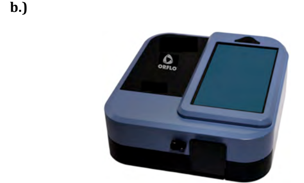
Figure 1 – a.) Orflo's Moxi GO II – Next Generation Flow Cytometer. 488nm Laser, 2 PMT (PMT 1 = 525/45nm, PMT 2 = 561nm/LP or 650nm/LP (swappable filter)). configuration Image shows user loading a sample into the two-test disposable flow cell. b.) 532nm laser (single 580/37nm filtered PMT) configured Moxi GO 532.